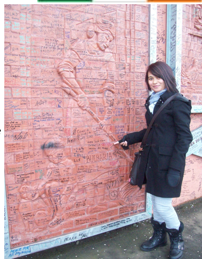
Lourdes signed the Peace Wall in Belfast, Northern Ireland, while on a walking tour of the murals that testify to the history of the Troubles in Northern Ireland.